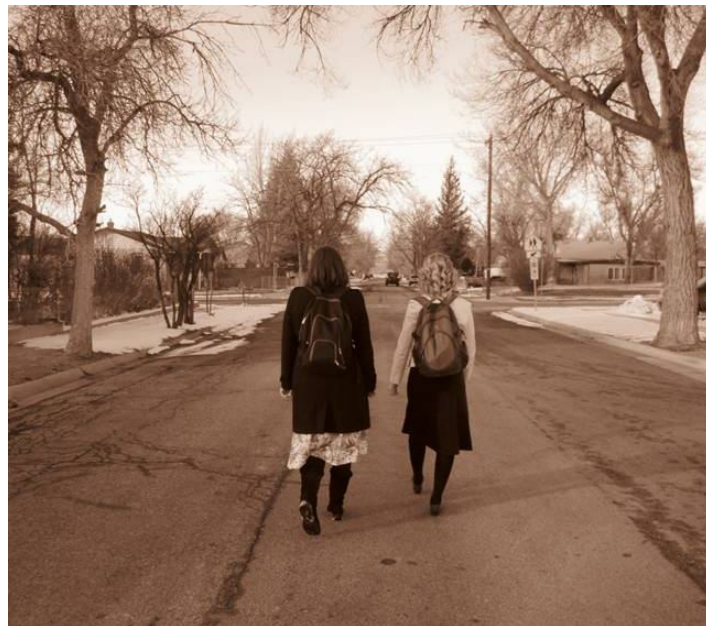
The end of another rewarding Missionary Day!