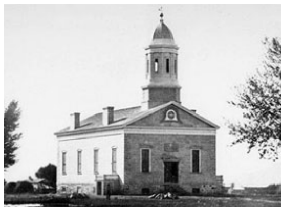
Old Provo Tabernacle

The history of the city of Provo began in September 1849, when President Brigham Young and his counselors headed a small caravan from Fort Utah to find a location to start a city. The center block of the planned mile-square city would be reserved for a chapel and schoolhouse. This "Public Square" was marked at present-day Pioneer Park, located at Center Street and 500 West. However, conflicts and disagreements combined with a lack of building materials slowed work on the meetinghouse. A foundation had been laid by 1856, but Brigham Young advocated abandonment of the project and moved Provo's center five blocks east to today's Tabernacle Block.