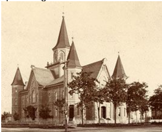
Provo Tabernacle, original exterior

The exterior of the Provo City Center Temple will reflect the original design of the 88' x 160' Provo Tabernacle, which featured a magnificent 147-foot central tower.