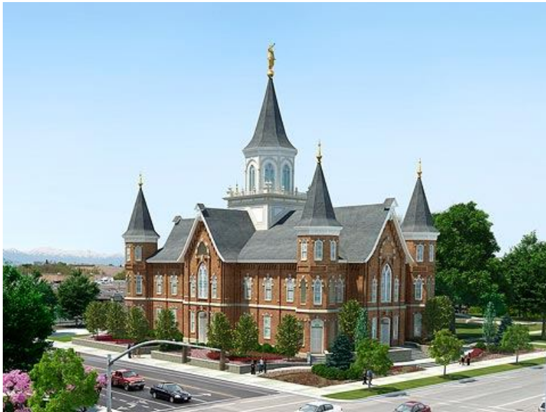
Possible appearance of the completed Provo City Center Temple.

As of mid-February 2012, excavation activities are nearing completion north of the temple where BYU archaeology professors and students have unearthed the foundation of the "Old Provo Tabernacle." NuSkin International has agreed to sell its parking terrace to the Church, located south of the temple, as it constructs a new facility further west. City officials anticipate that the parking structure, smokestack, and boiler will be demolished. Two buildings south of the temple, on land already purchased by the Church, have already come down: the former Los 3 Amigos Restaurant and Provo Travelodge Motel. The exterior brick walls of the former tabernacle are being supported by heavy steel girders provided by Jacobsen Construction—the general contractor for the temple. No groundbreaking date has been announced.