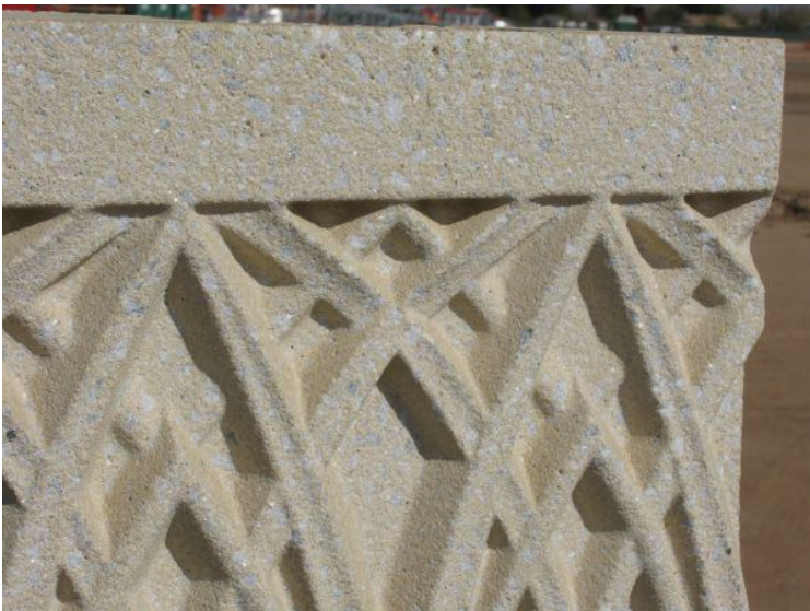
Close up of the detailed trim of the edge of the temple stone facing.

The First Presidency has announced the open house and dedication dates for the Kansas City Missouri Temple. The public is invited to visit the temple open house from Sat. April 7 until Sat. April 21, 2012, excluding Sundays. Reservations are requested. The temple will be formally dedicated on Sunday, May 6, 2012 with broadcasts to Church units within the temple district. A cultural celebration featuring music and dance will be held Sat, May 5, 2012.