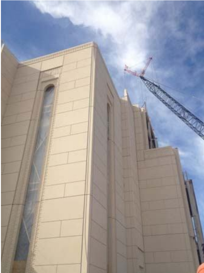
Close up details of corner windows.