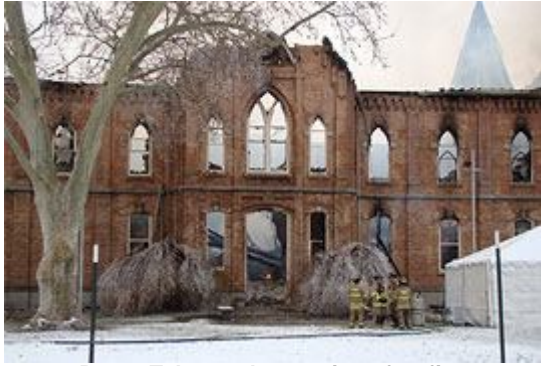
Provo Tabernacle morning after fire.

Speculation of the Church's plans for the Provo Tabernacle began shortly after an accidental fire devastated the structure on December 17, 2010