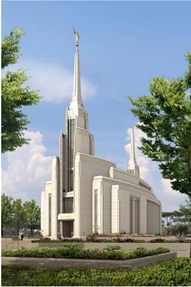
Artist's rendering of the completed Rome, Italy temple.