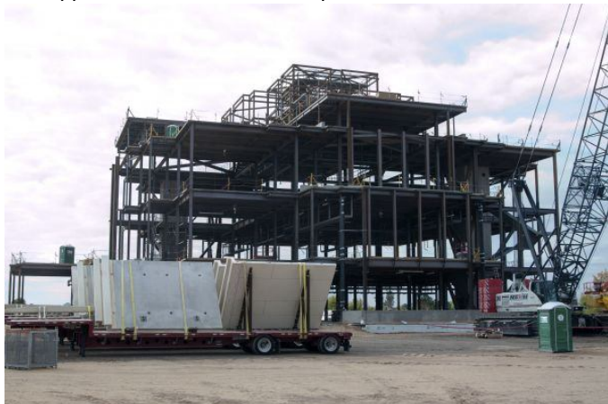
Photo taken of the Gilbert, Az. temple Dec 12, 2011. The outer stone surface panels are being installed on the upper-most levels of the temple exterior.

Exterior stone panels on trailers awaiting installation on top levels of the temple exterior.