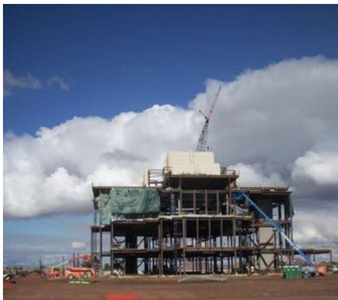
Exterior panels in place on top levels of temple exterior.