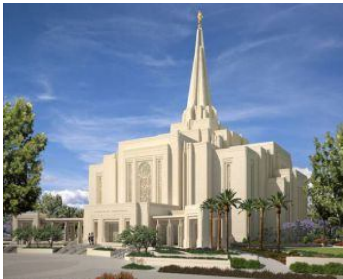
Artist's rendering of the completed Gilbert, Az Temple.