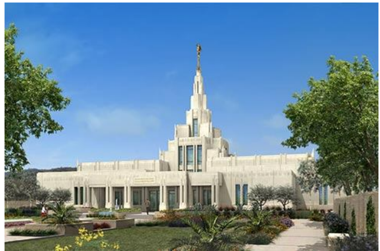
Artist's drawing of the completed Phoenix, Az. Temple located at 5220 W. Pinnacle Peak Rd.