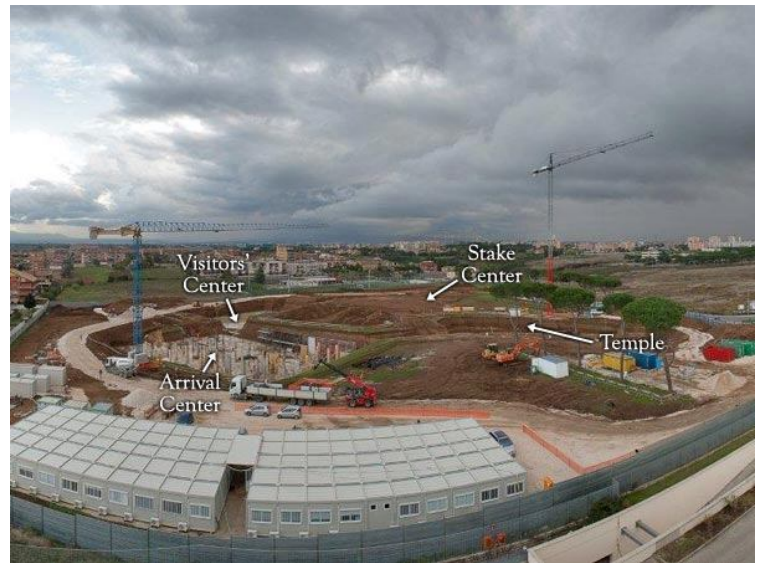
Artist's rendering of the location of structures intended to be built on the Rome, Italy temple site.

been taking place. In the last 5 years, the Church in Italy has gone from 3 to 6 stakes. The Rome Temple will be the 12 th in Europe and the first in Italy. The charming Villeta which stood at the highest point of the temple site was used for a time as an apartment for the full time missionaries. It was razed to make room for the construction of the temple. It is expected that construction will be completed in 2014.