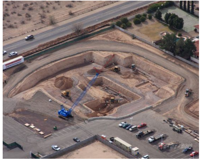
Arial Photo of Phoenix Temple construction site 7 Dec, 2011