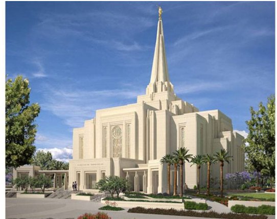
Artist rendering of the Gilbert, Az. Temple located at SE corner of Pecos and Greenfield.

The Gilbert, Az Temple. Taken 12 Nov 2011. The 3 thick and solid columns in the interior are elevator shafts. The steeple will be mounted on the smaller square on top of the structure. Concrete has been poured for the baptismal font in the basement area.