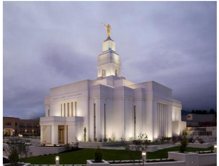
The Quetzaltenango, Guatemala Temple

Open House for the Quetzaltenango, Guatemala Temple was held Nov 11 through the 26 th . The new temple is scheduled to be dedicated Sunday, Dec. 11 by Pres. Dieter F. Uchtdorf of the First Presidency. This will be the second temple operating in the country of Guatemala.