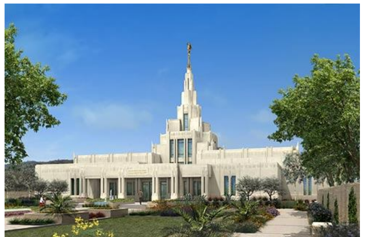
Artist's drawing of the completed Phoenix, Az. Temple located at 5220 W. Pinnacle Peak Rd.