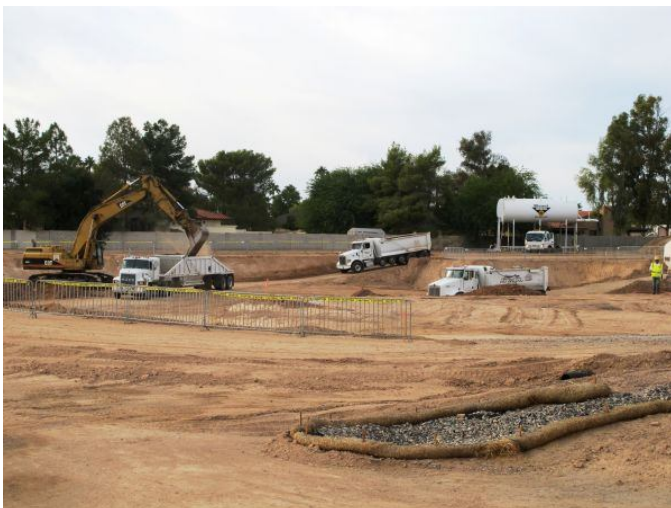
Excavation for the Phoenix Temple foundation has begun. 10 Nov 2011 photograph. Site is located in a residential neighborhood.

The Gilbert, Az Temple. Taken 12 Nov 2011. The 3 thick and solid columns in the interior are elevator shafts. The steeple will be mounted on the smaller square on top of the structure. Concrete has been poured for the baptismal font in the basement area.