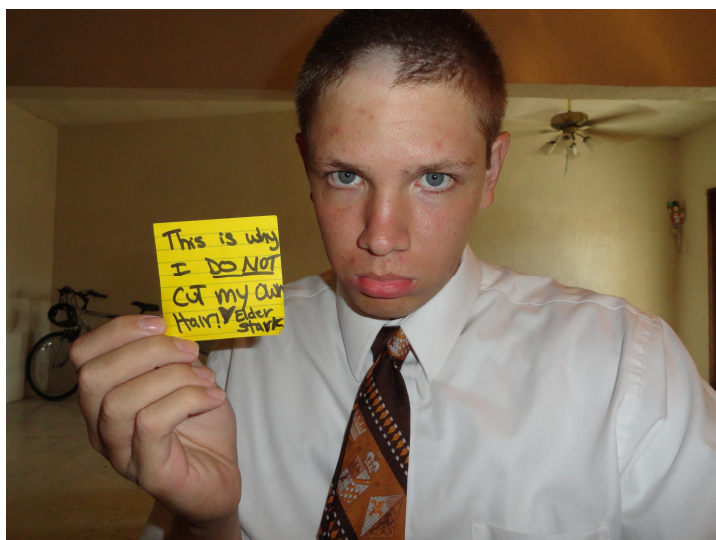
Bad Hair Day! (The Post-it says it all!)

Remember to be a missionary. Happy Thanksgiving. Love - Elder Stark