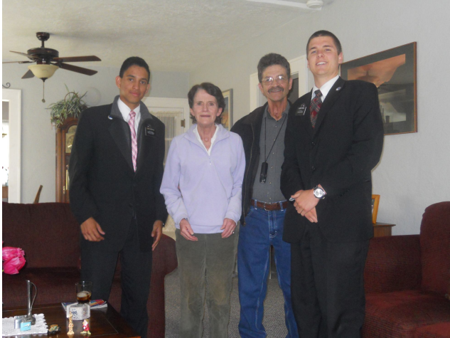
This lady asks questions the missionaries love to hear!

The Grandma that we live with, fell and broke her arm. She is doing better and hopefully can come home soon, but in the meantime we are watching the house and taking care of her dog.